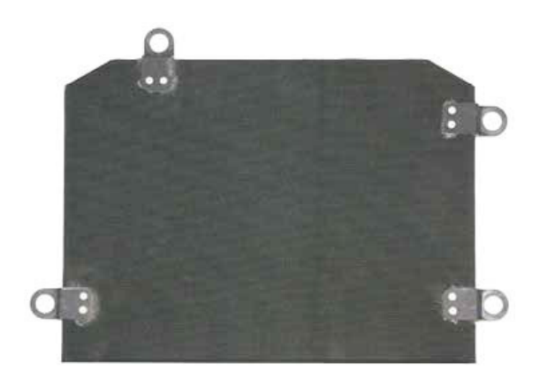
Monolithic Wall Armor Panel

BAE Systems prides itself on over 30 years of experience in developing and manufacturing lightweight composite armor protection systems for military aircraft. Utilizing our expertise in ceramic composite armor, BAE Systems introduced the first successful military armored crashworthy crew seat for the UH-60 Black Hawk aircraft in 1977.